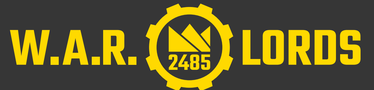
Full Logo Example

For readability, the Full Logo should always maintain a height of at least 1.25”.