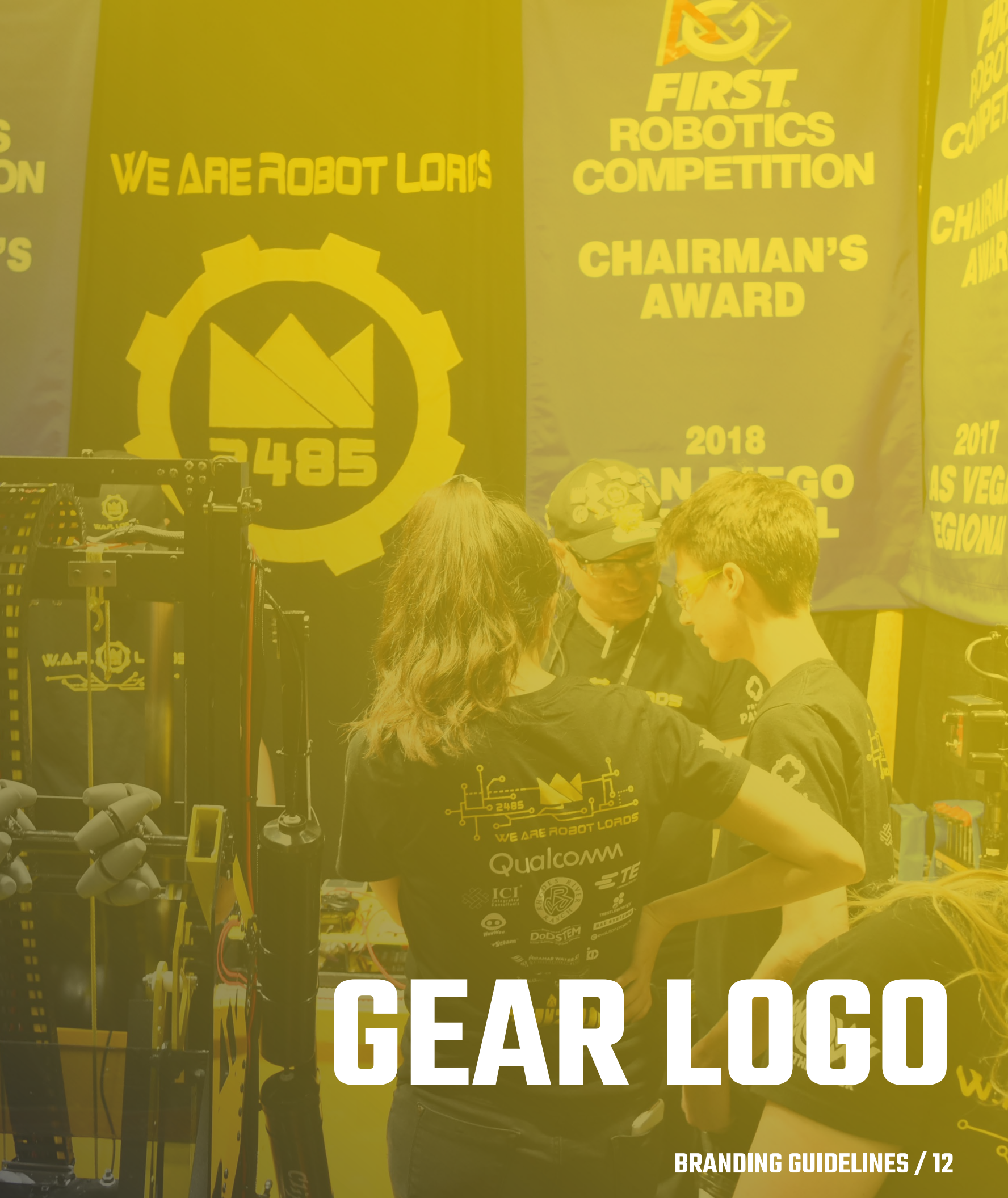
Gear Logo Example (with Spacing Lines)

The “X” here represents the height of the numbers. Each side should be spaced with at least the length of X. Note that the X length increases with logo size. The Gear Logo should be at least 1.25” inches in length on each side.